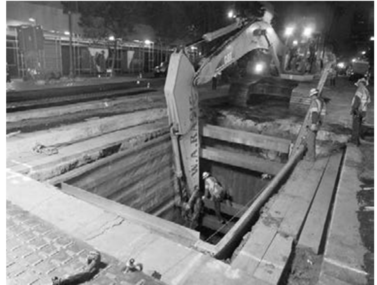
Setting Power Vault on Wilshire