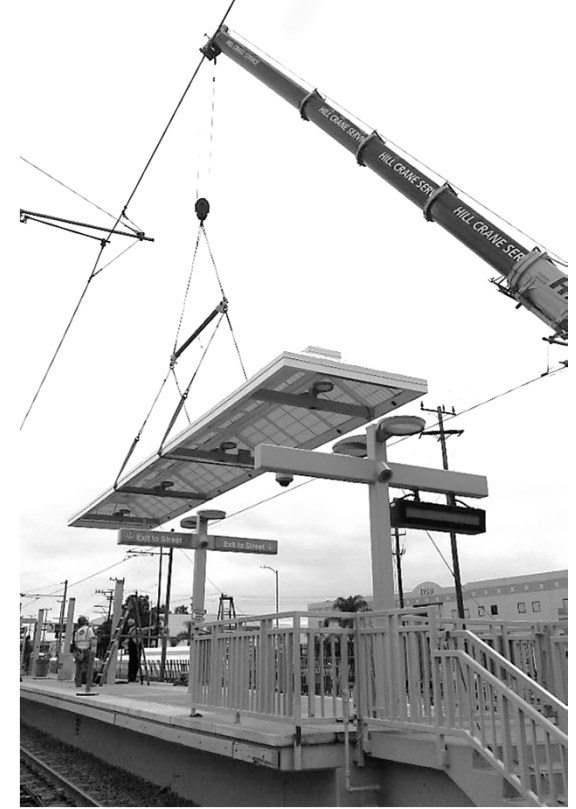
Washington/San, Pedro/Grand, and Canopies; all three set on June 6, 2015