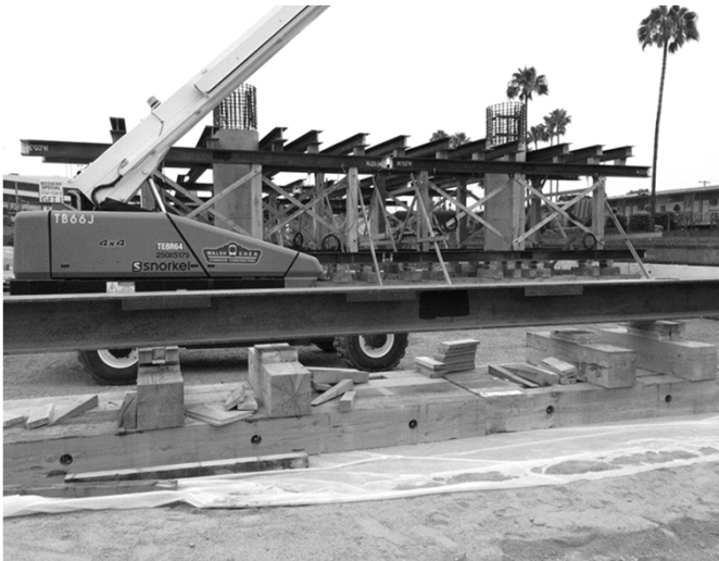
Green Line Connection & Aviation/Century Station