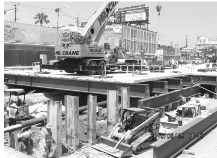
Vernon Station Decking