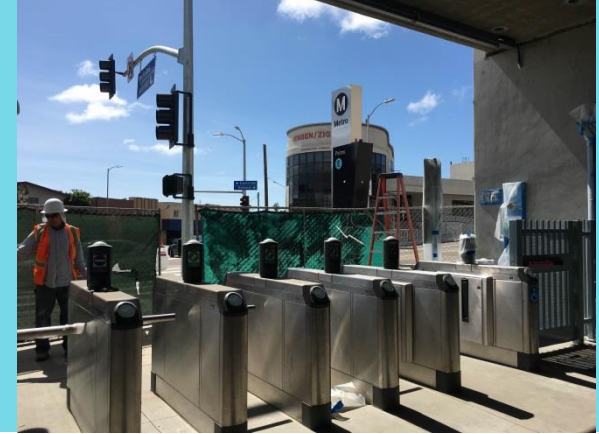
Westwood/ Rancho Park