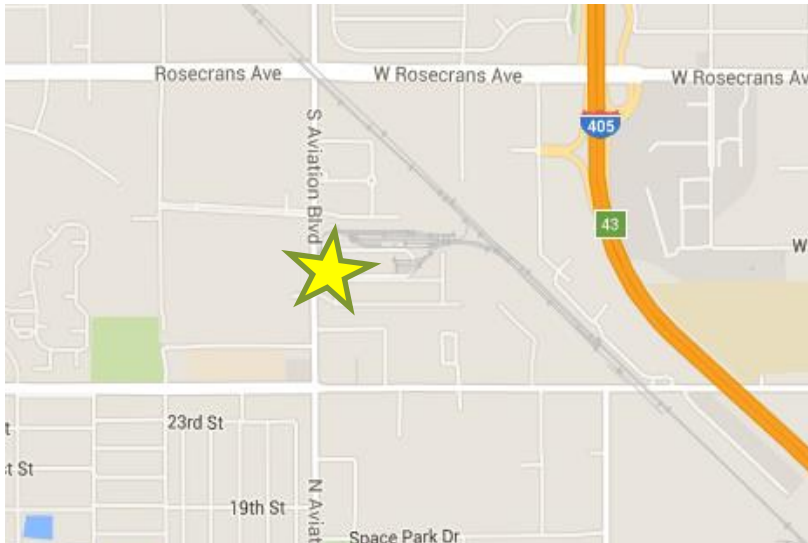
Division 22 – Green Line, Hawthorne