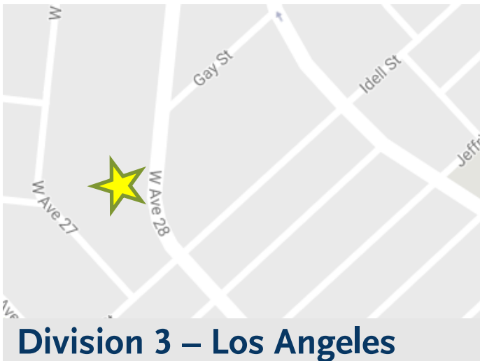
Division 3 – Los Angeles