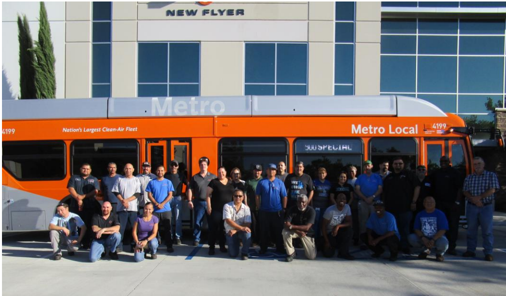
Bus 4199 finishing final assembly at New Flyer, Ontario CA