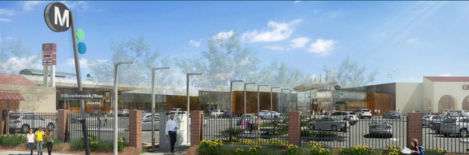
View east from Wilmington Ave toward new pedestrian promenade connecting Wilmington Ave to the station. Improved pedestrian connections will provide safe and more direct walking paths to destinations surrounding the station.