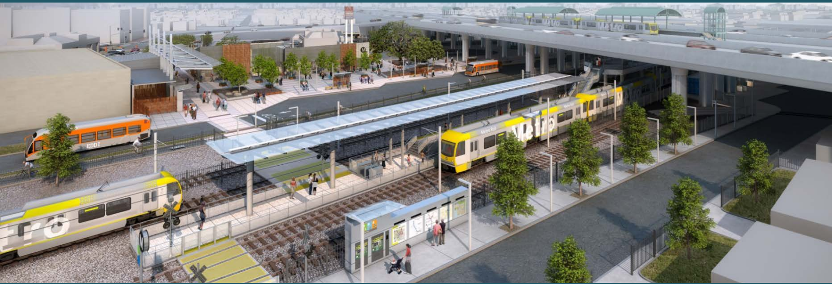
View northwest from Willowbrook Ave East toward new southern crossing and community plaza. The project will daylight the station by extending the Blue Line platform south of the 105 freeway. A new pedestrian crossing will provide a safe connection across Metro and Union Pacific tracks for community and patron use.