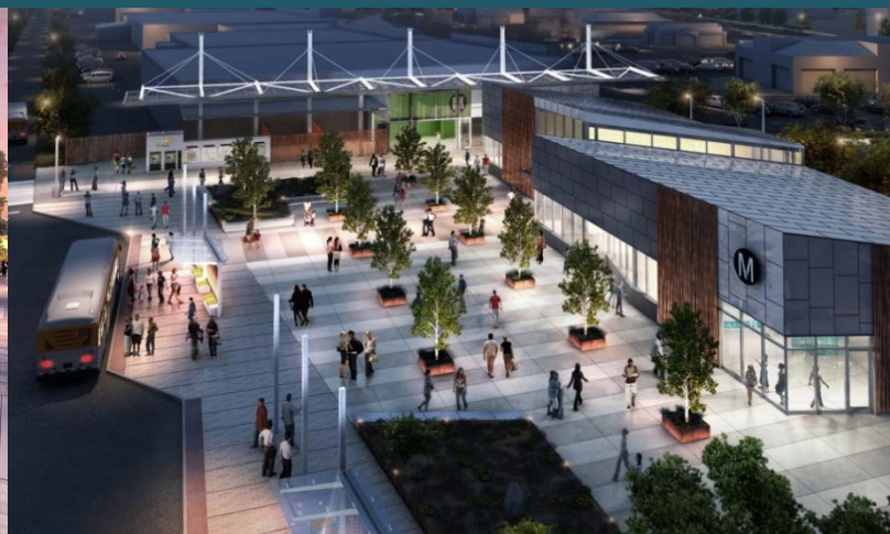
View south toward bus bays and community plaza The mezzanine connecting the Blue and Green Lines will be expanded and include new stairs and escalators to speed connections between the rail lines. Bus bays will be consolidated and located adjacent to the new plaza to improve connectivity so that waiting for the bus isn't quite so lonely.