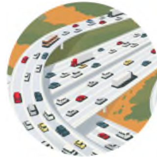
Congested Corridors Solution $200 million/year