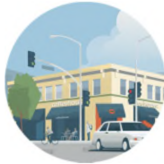
Local Street and Road Improvements $1.5 billion/year