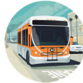
Public Transit Improvements $750 million/year