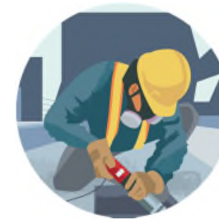
Local Partnership Program $200 million/year