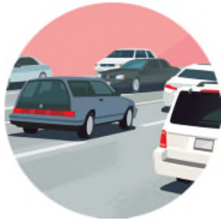
Highway Improvements $1.5 billion/year