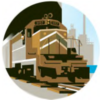
Freight Capacity Extension $300 million/year