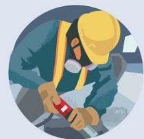
Local Partnership Program $200 million/year