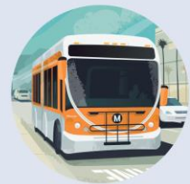
Public Transit Investments $750 million/year