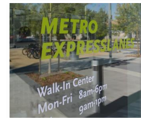
Customer Service Center Operations