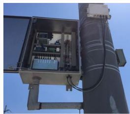
Roadside Toll Collection System