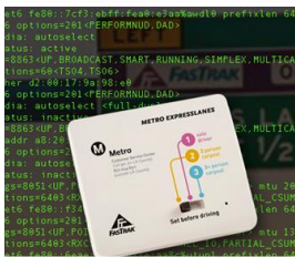
Back Office System