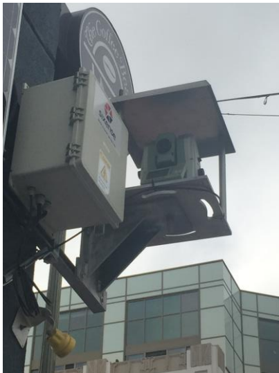
Survey camera shoots signal and reads current elevation of street target