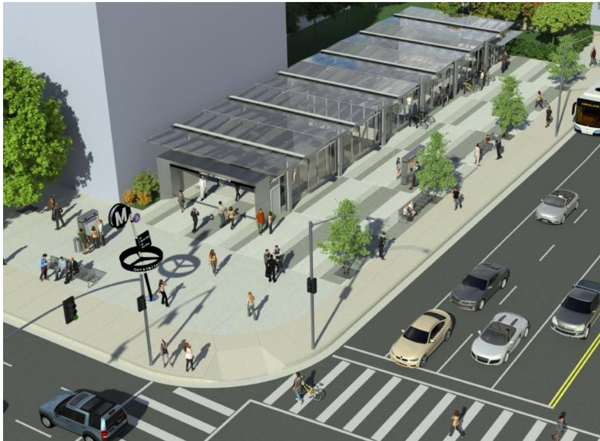
Spot Check #5 - Purple Line Section 2 Transit Project Century City Constellation Station – Main Entrance Final Design