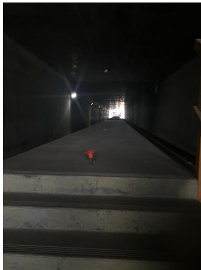
Center walkway at UG-1 Area for lighted handrail, 4-inch wide thermoplastic edge striping, overhead lighting adjustments, power circuits, and redundant circuits