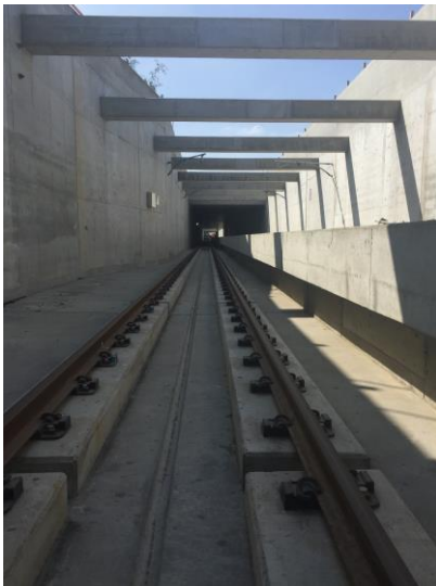
UG-1 - Tunnel section without the cover