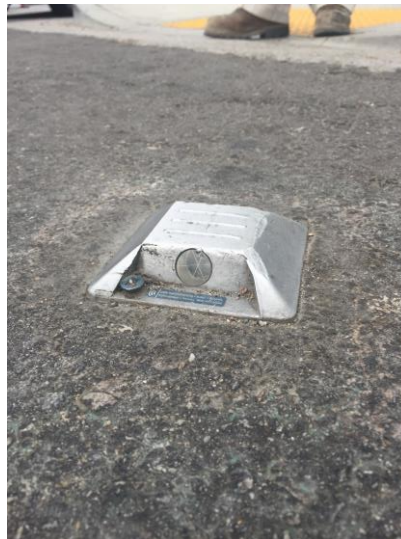
Street instrumentation target similar to lane marker but has an initial recorded elevation camera shoots signal to reflective prism