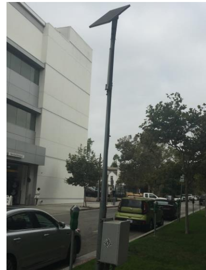
Solar powered instrumentation