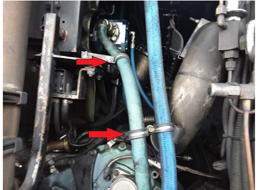
Hydraulic fan oil line securement