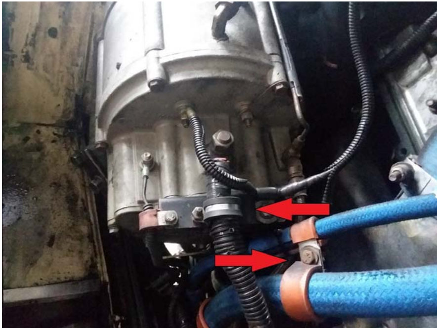
Alternator cable and hydraulic oil line securement