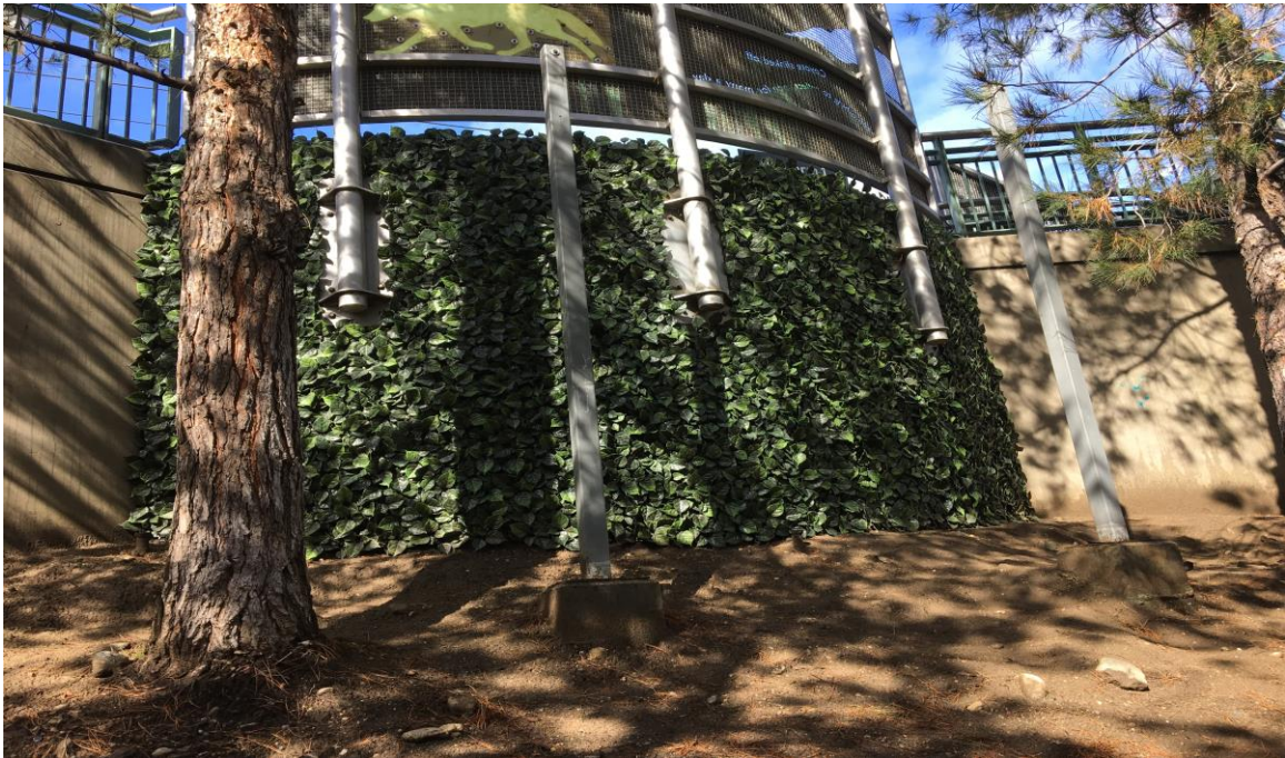
PGL LINCOLN CYPRESS STATION