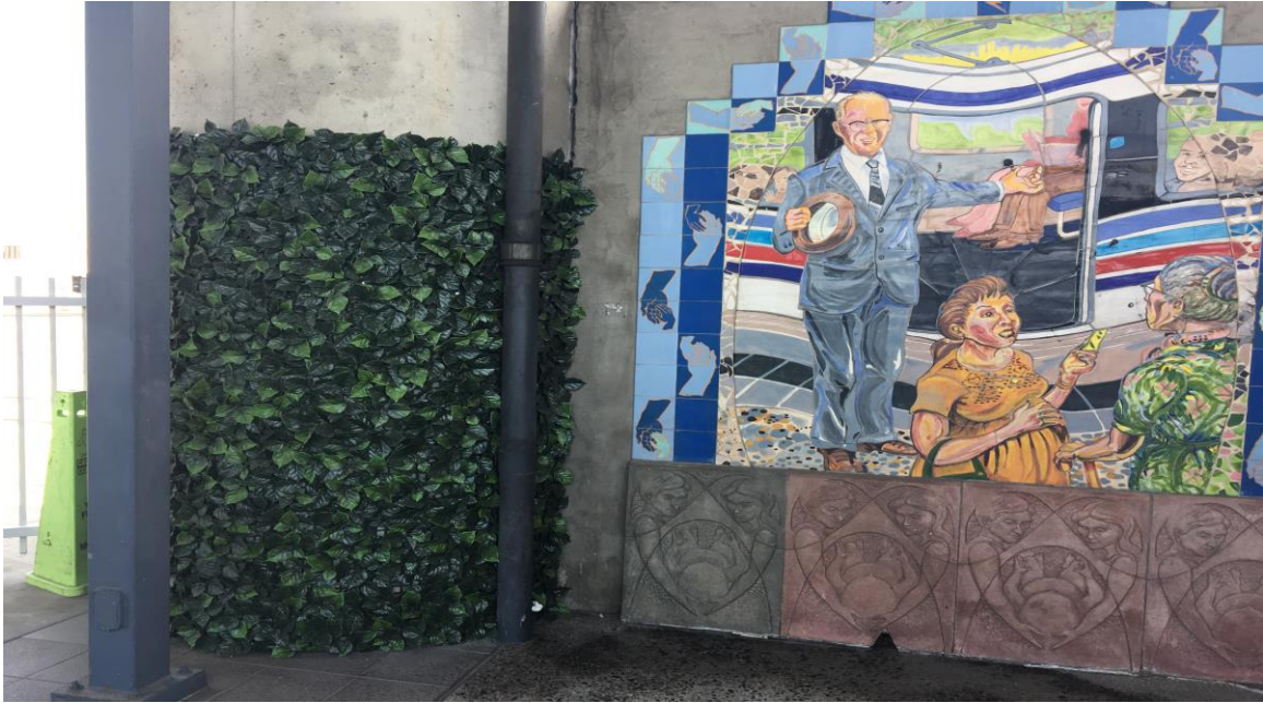
MBL SLAUSON STATION