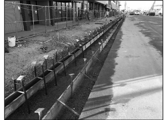
Sidewalk Grades (Expo Closure)