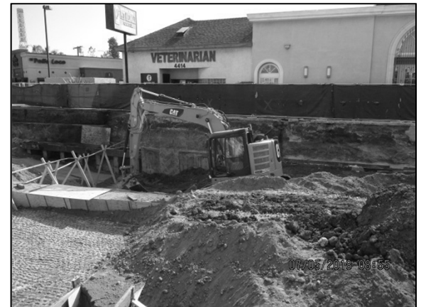
Walers Left In Place (Vernon Closure)