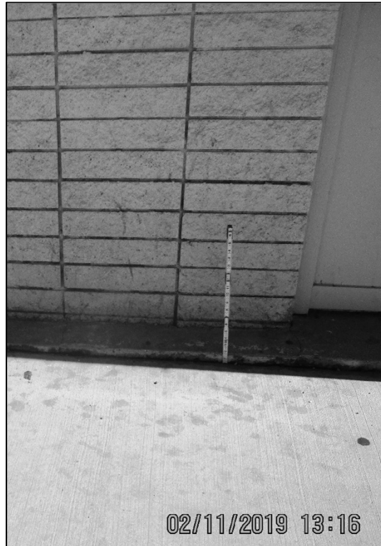
Back-of-walk lippage w/private property (Crenshaw NB 57 th St )