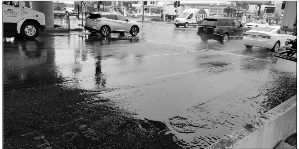
Aviation/Century Blvd. Ponding at Median Design Issue