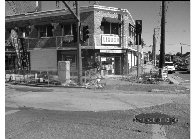
Block out (Northeast corner, 54 th Street)