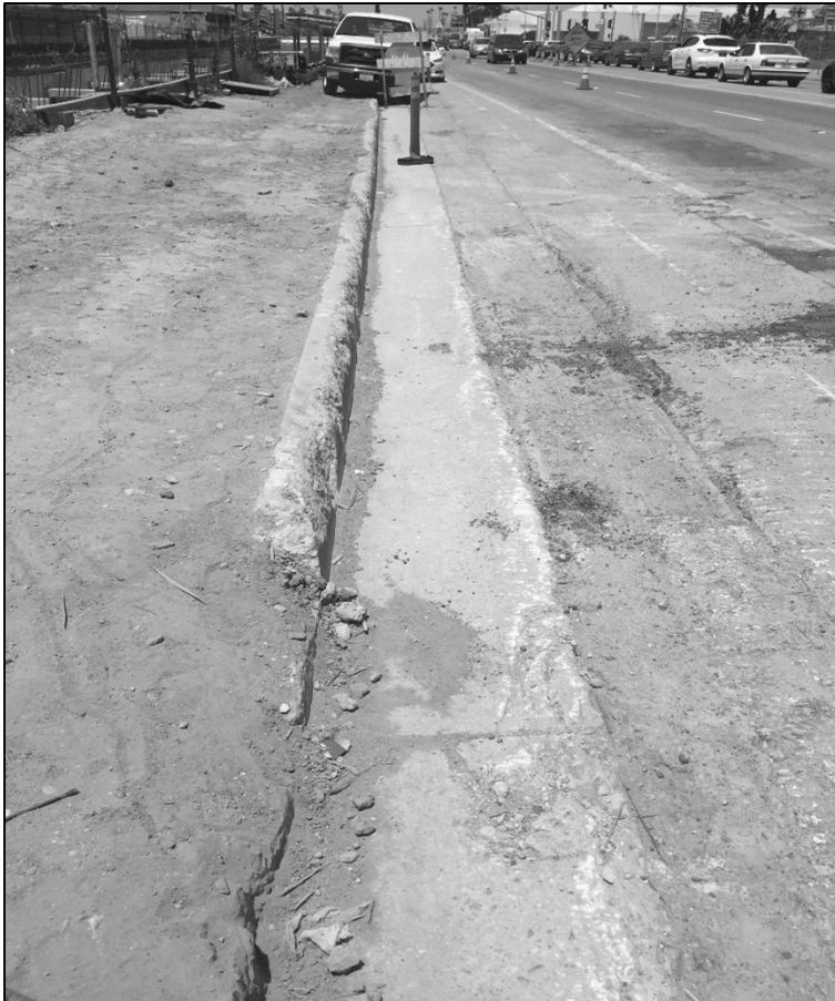
Aviation/104 th St. Damaged Curb and Roadway NNC 043-0818