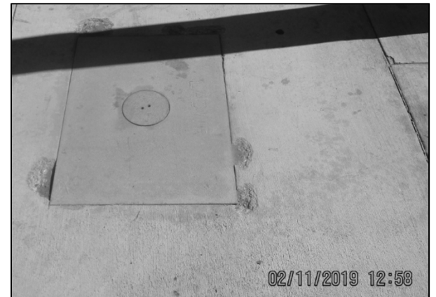
Spalling at Meter Box (West side, 50 th & 52 nd )