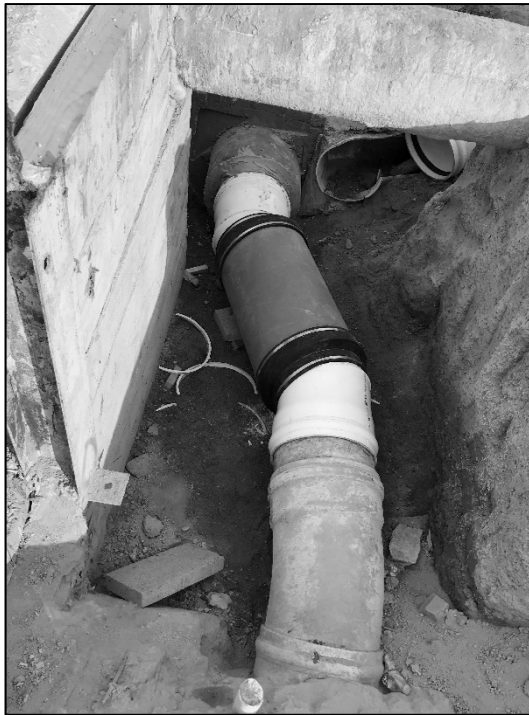
Hobus Pipe Connection to GSMH (Expo Closure)