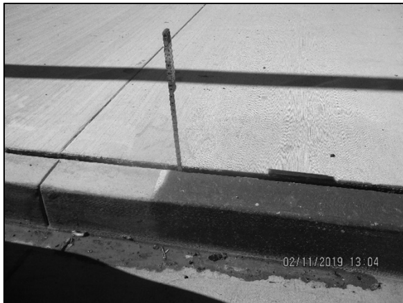
Heaving of Sidewalk (West side, 54 th & 57 th )