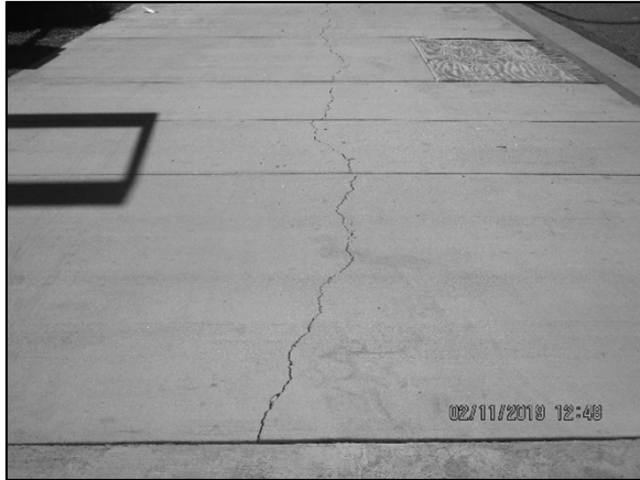
Crack in Sidewalk (East side, 50 th St.)