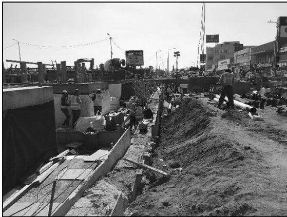
Gas Line Embedded Forms Left in Place (Expo Closure)