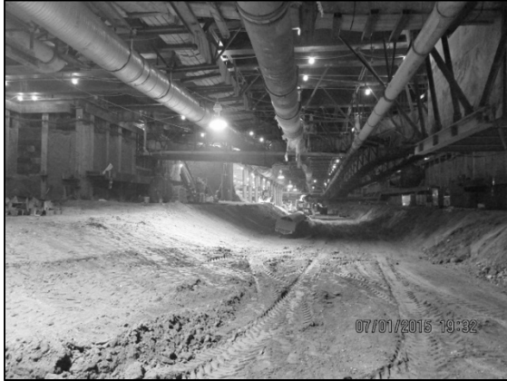
AT&T Line Conflict w/SD (MLK Closure)