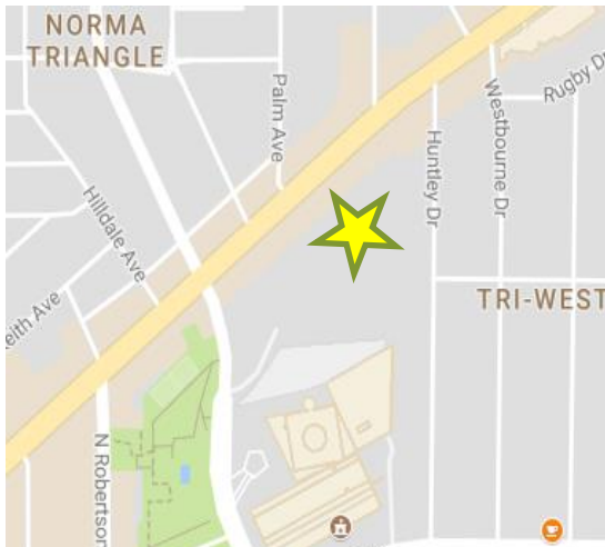
Division 7 – West Hollywood