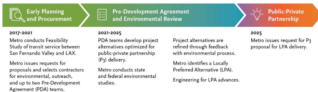
Figure 1 below shows the current Project status along the overall Project Development Process.

On July 27, 2019, the Board approved the PDA approach to support the Project’s development and approved the solicitation of PDA contracts for the Project. The PDA process allows for early contractor involvement in project design through the development of independently proposed alternatives. Services associated with the PDA process and outreach services are each proceeding under separate procurements.