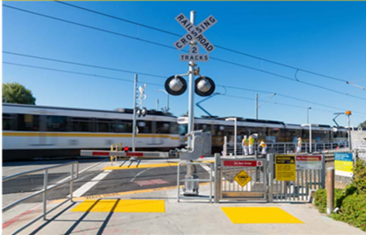
REGIONAL AT CORRIDORS