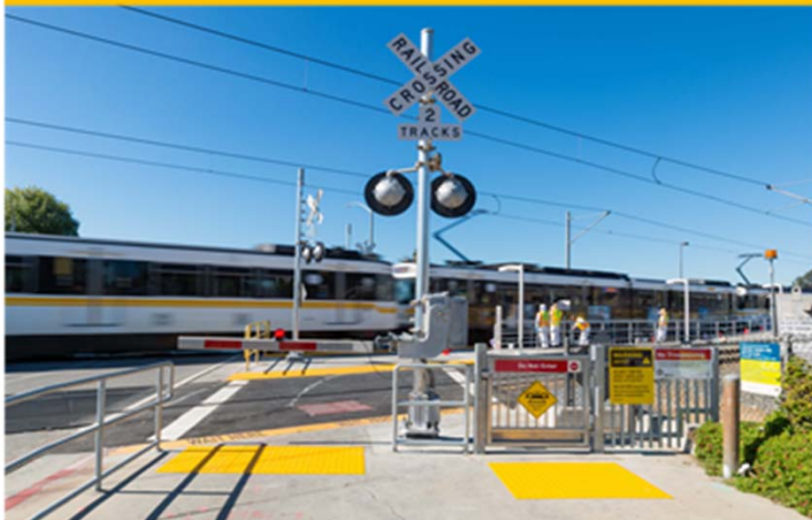
REGIONAL AT CORRIDORS