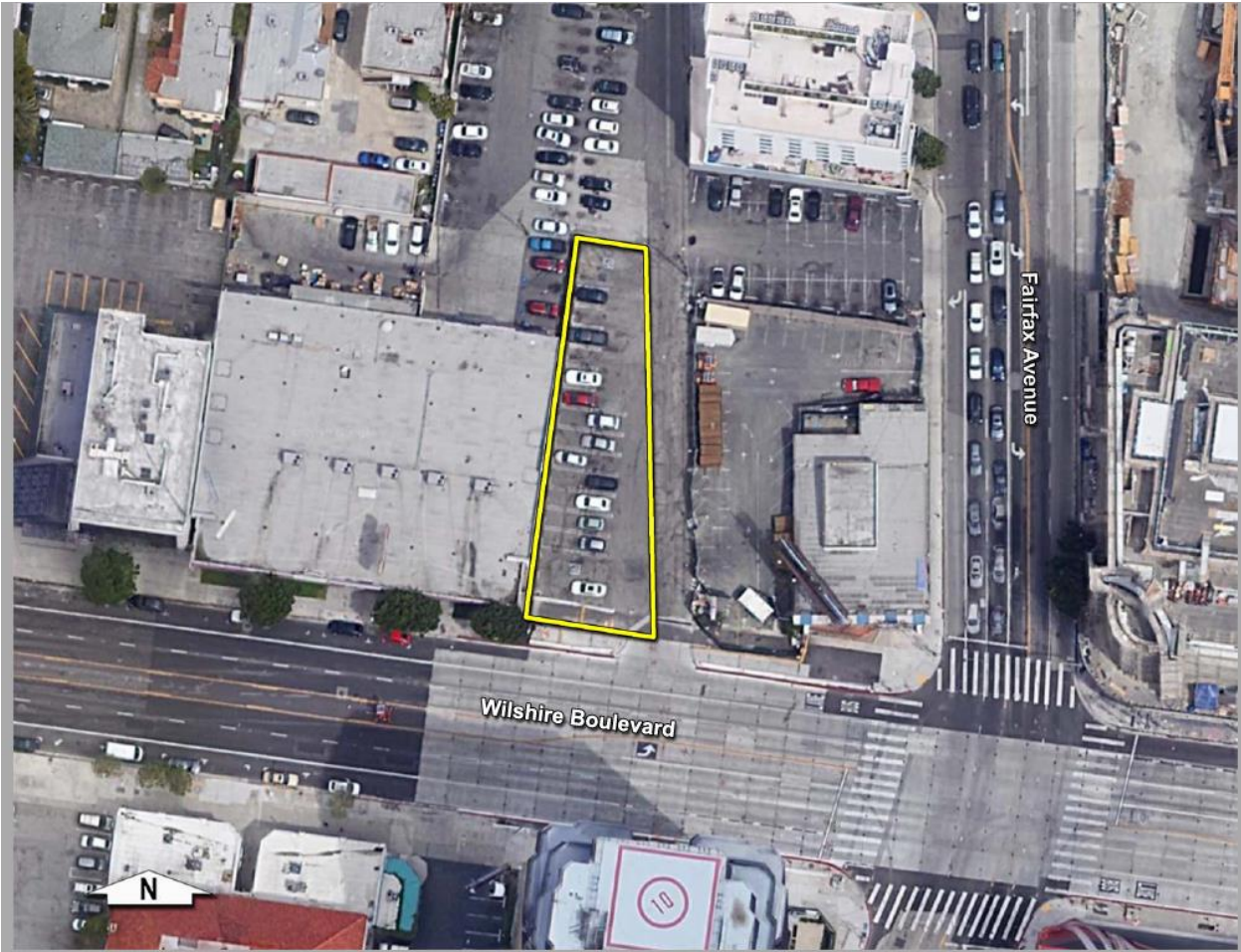
Marinello Parcel 6111 Wilshire Boulevard LA, CA 90048