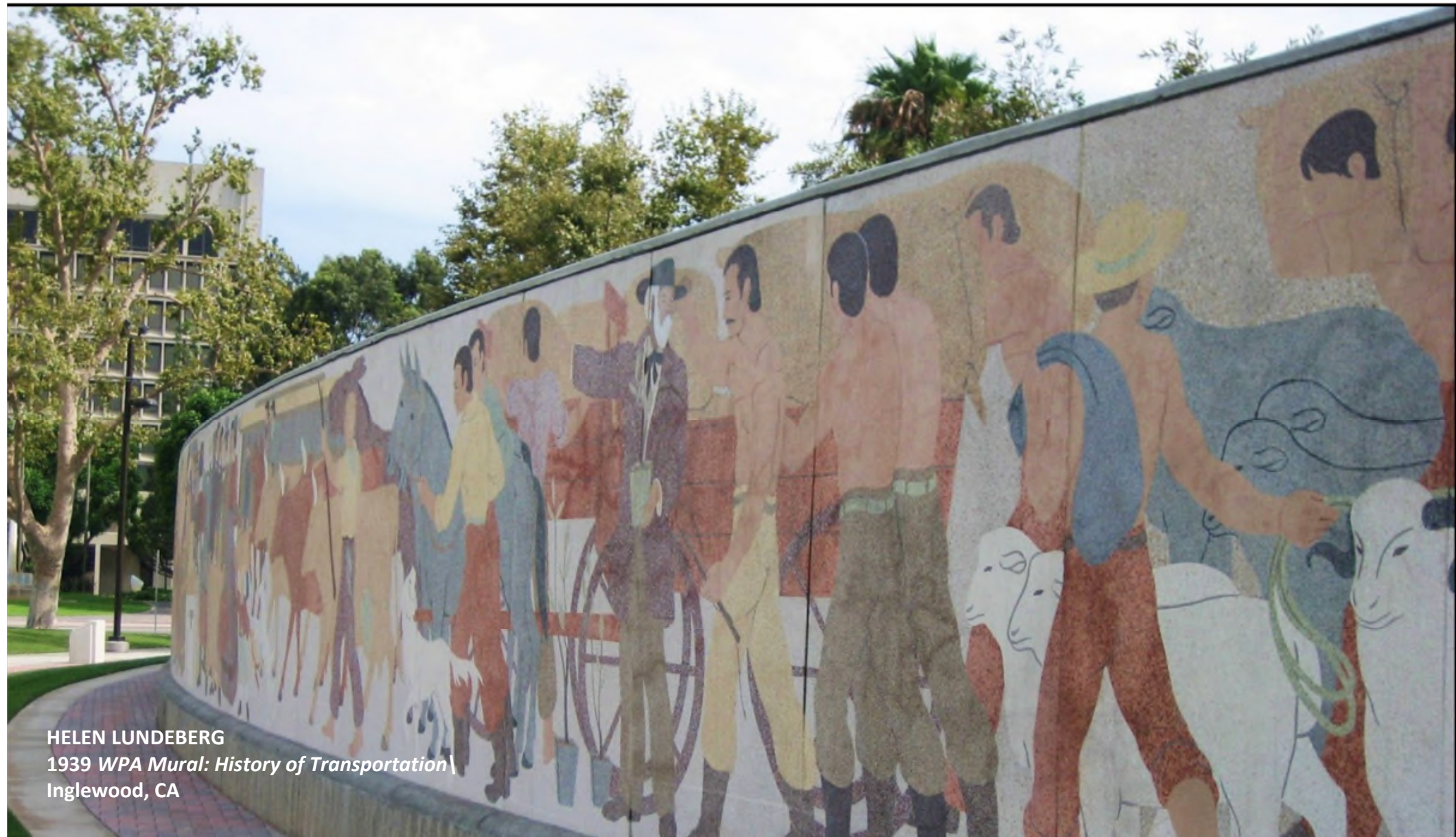
HELEN LUNDEBERG 1939 WPA Mural: History of Transportation Inglewood, CA

“Think about how artists might be included in the Reimagining of transportation”