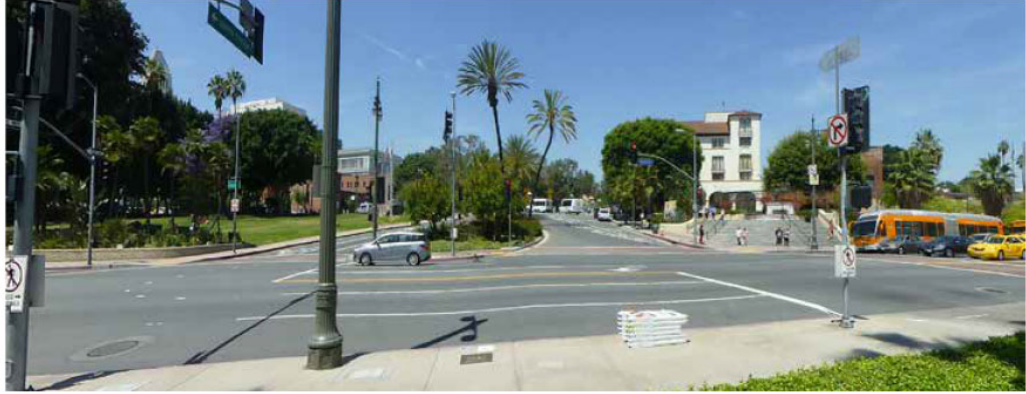
EXISTING View from Union Station west up Los Angeles St. to El Pueblo