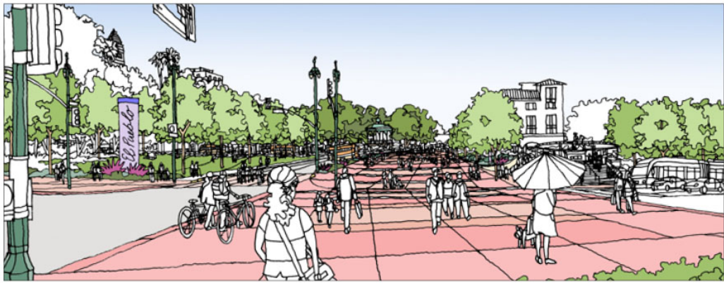
PROPOSED Los Angeles Crossing will have an enlarged/raised crosswalk and direct walk-bike path between Union Station and the Plaza at El Pueblo