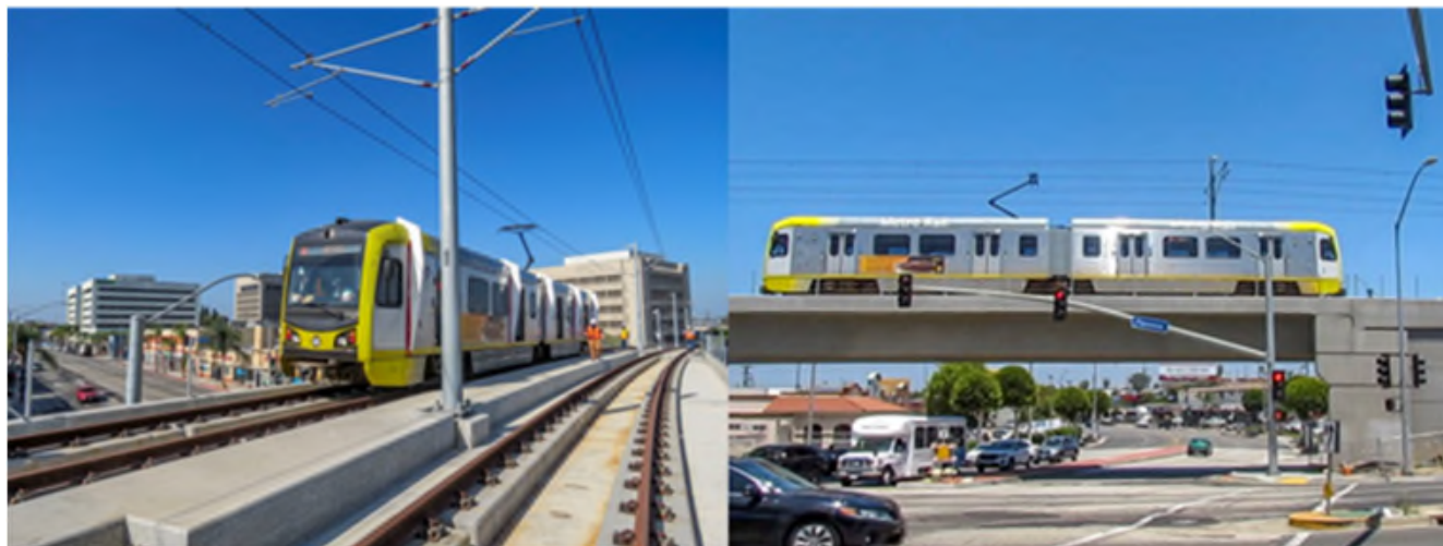
Train testing operations traveling over the La Brea Ave bridge.