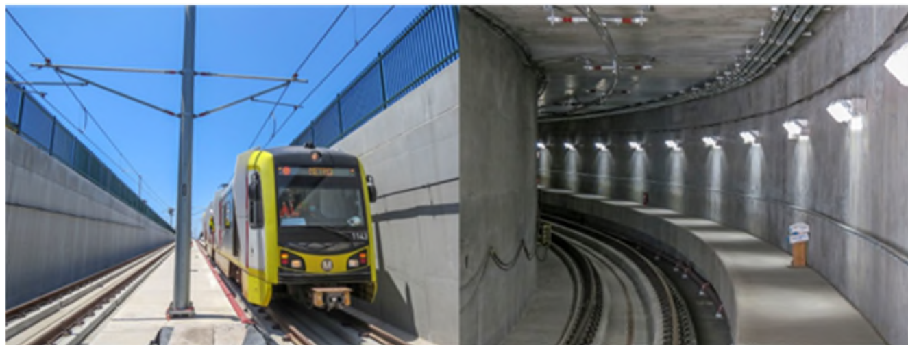
Train testing operations clearing into the tunnel below Crenshaw Blvd.