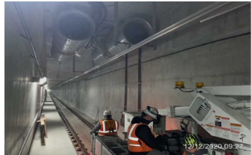
UG3 - Start-up crew inspecting tunnel booster fans