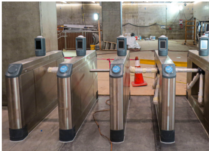
Expo Station mezzanine level fare gates