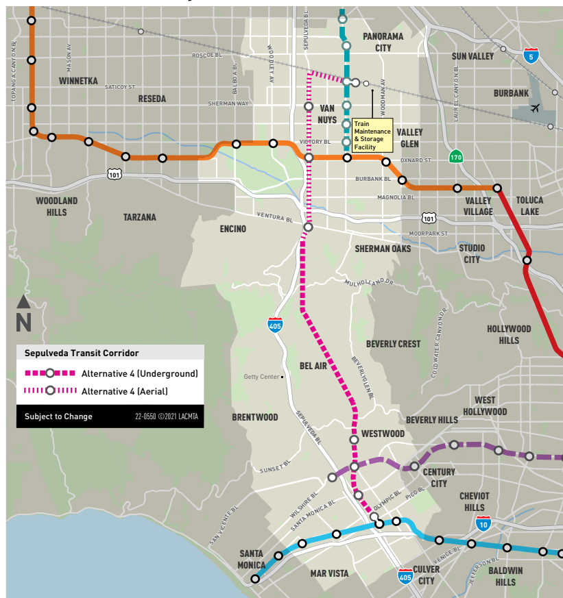
Alternative 4 (Heavy Rail)