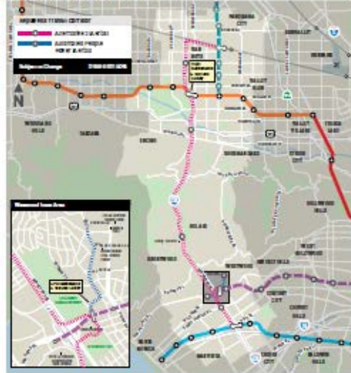
Alternative 2 (Monorail)