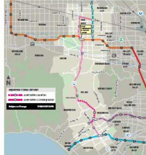
Alternative 3 (Monorail)