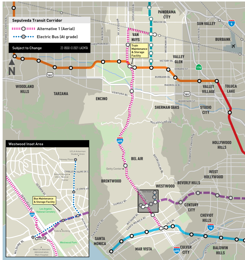
Alternative 1 (Monorail)