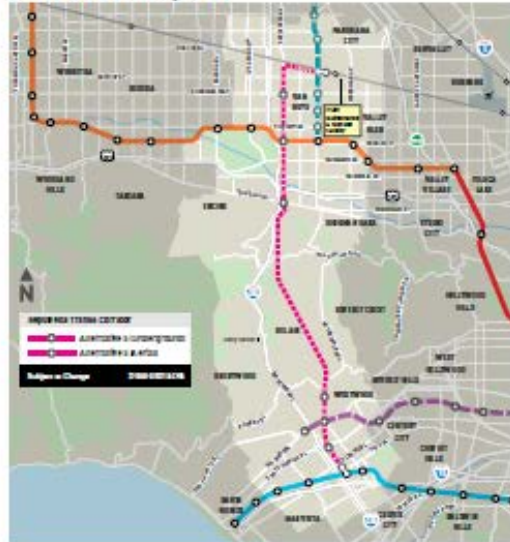
Alternative 5 (Heavy Rail)