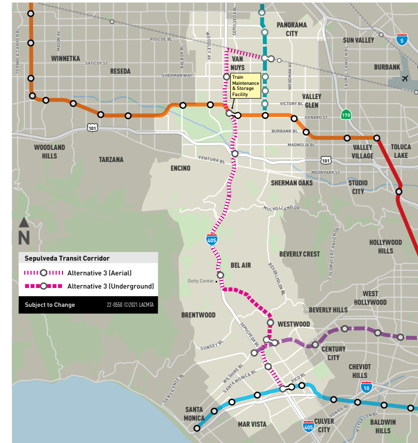
Alternative 3 (Monorail)