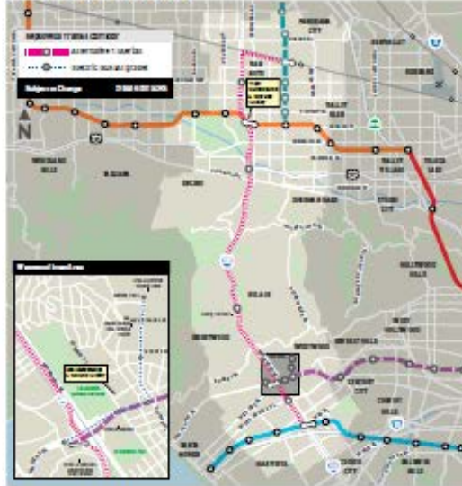
Alternative 1 (Monorail)