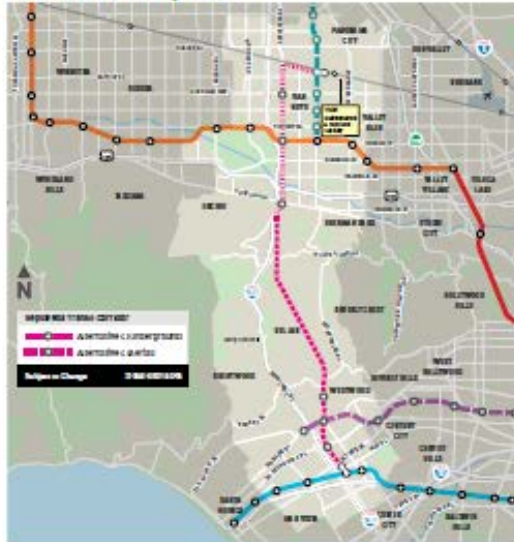
Alternative 4 (Heavy Rail)