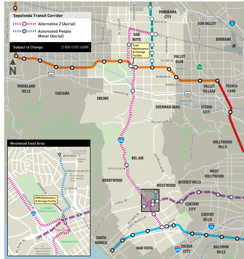
Alternative 2 (Monorail)