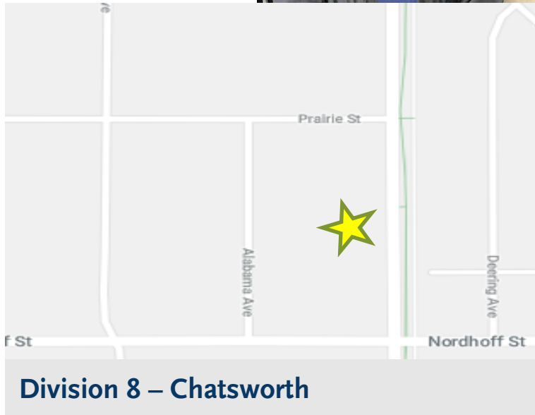
Division 8 – Chatsworth