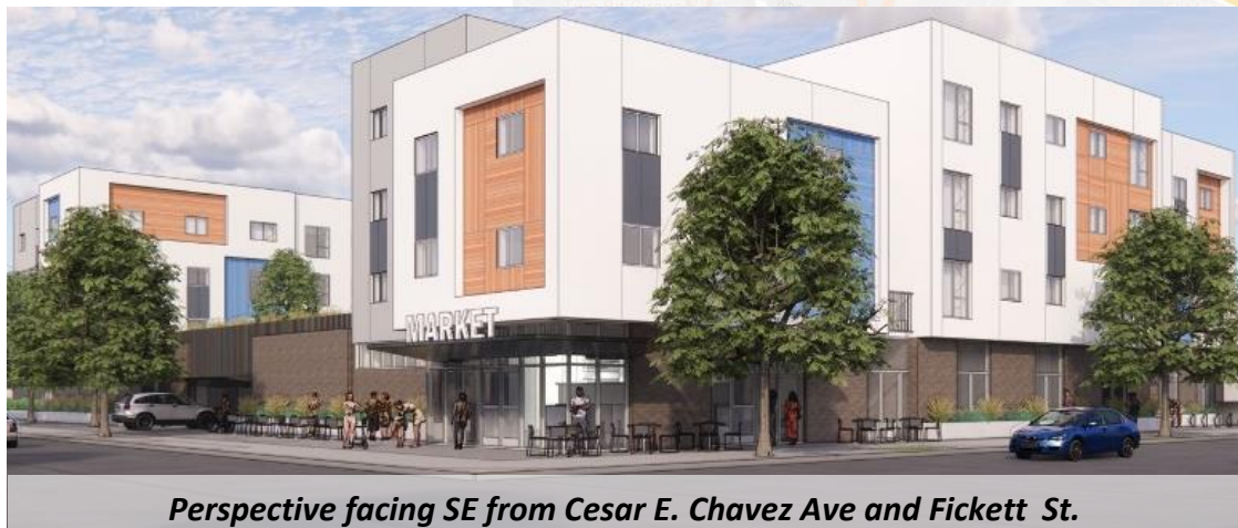
Perspective facing SE from Cesar E. Chavez Ave and Fickett St.