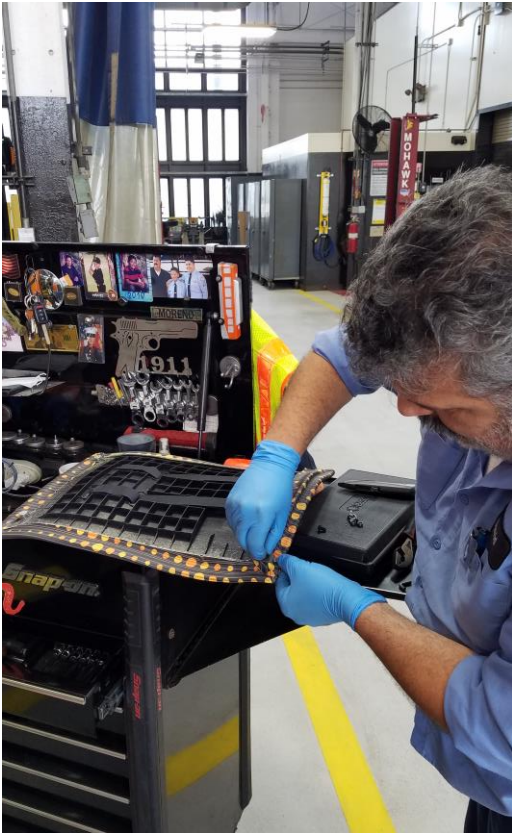
Prepare New Seat Insert