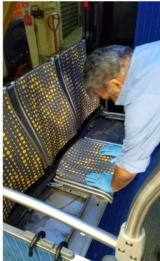
Install New Seat Insert