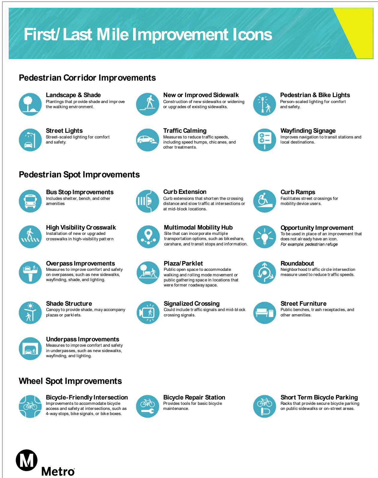
Figure 1. Graphic symbols and definitions for FLM Improvement Projects.