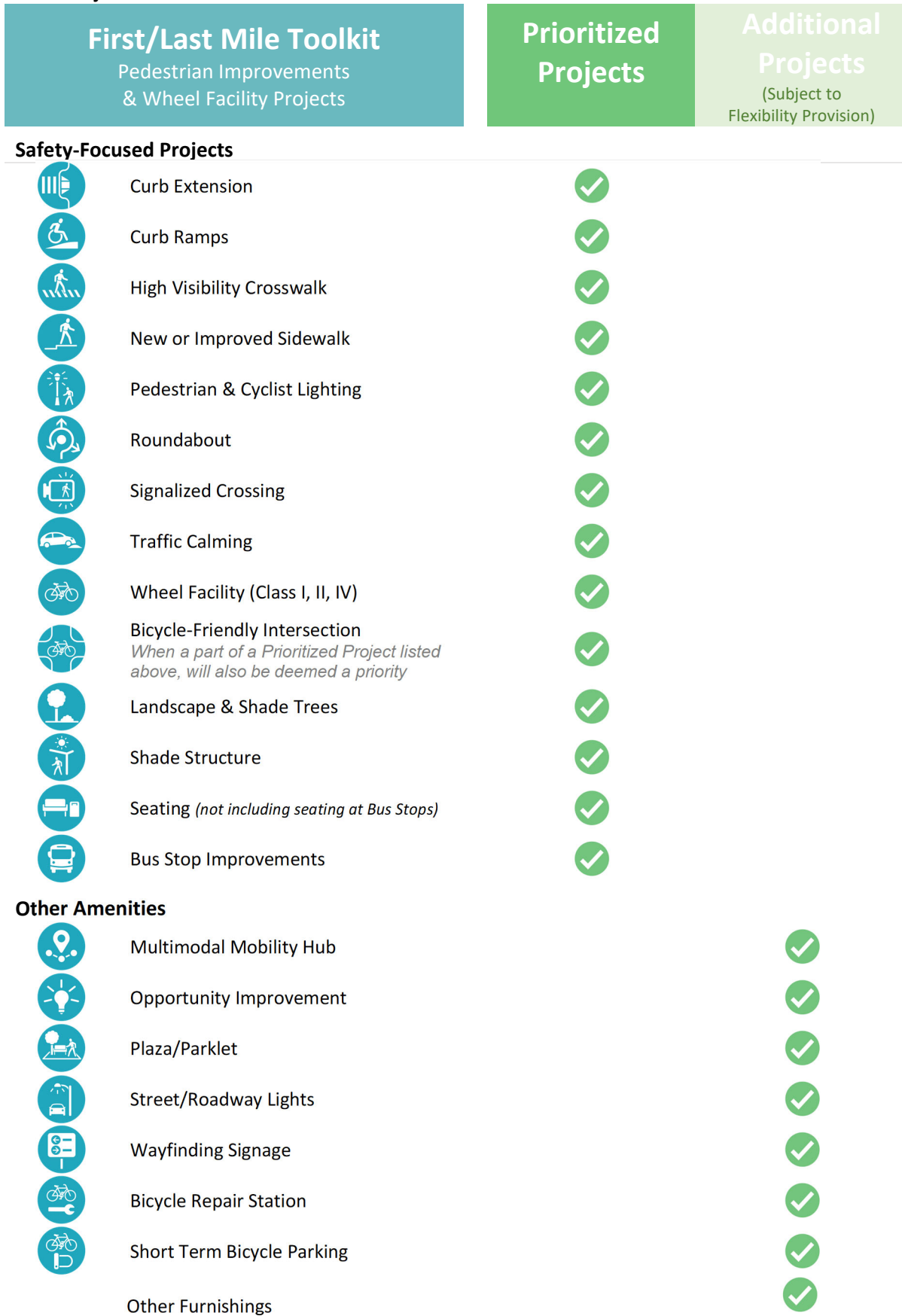
Table 1: Project Prioritization Overview