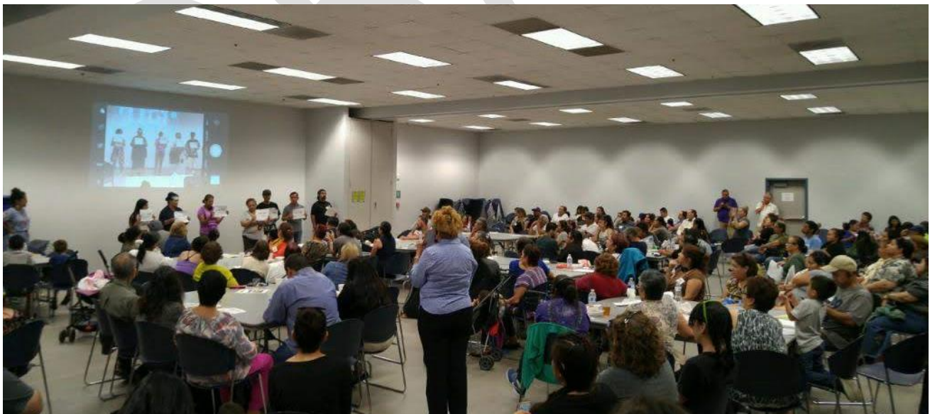
Shown above: Mariachi Plaza Project Introduction Workshop

A third meeting will be scheduled before the end of this ENA period that will be tailored to the survey results gathered from meeting #2 and to assess any further needs identified through this community engagement process.