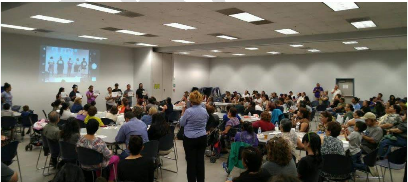
Shown above: Mariachi Plaza Project Introduction Workshop

A third meeting will be scheduled before the end of this ENA period that will be tailored to the survey results gathered from meeting #2 and to assess any further needs identified through this community engagement process.