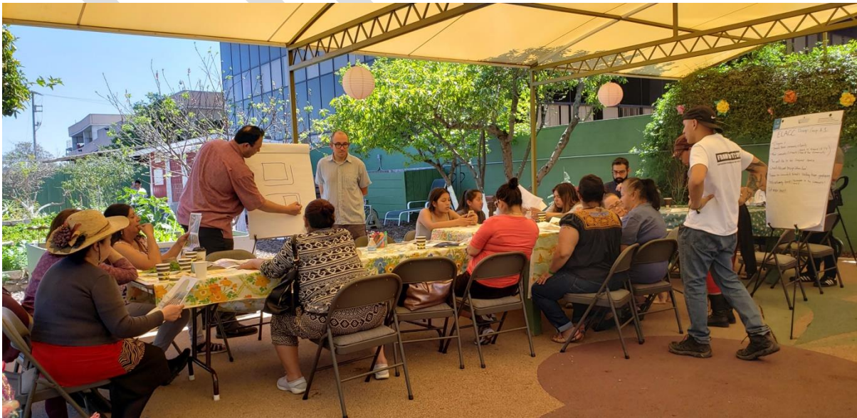
Shown above: Lucha Reyes open space visioning workshop