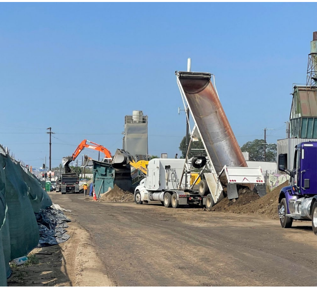
Processing Hazardous Soil