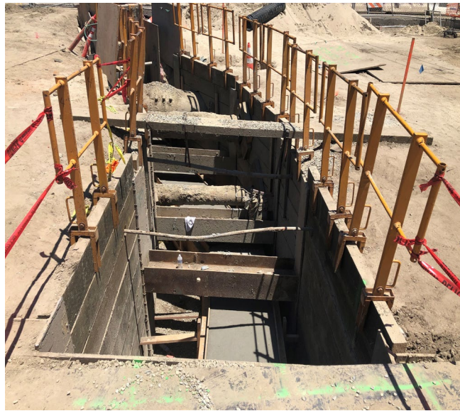
Differing Site Conditions