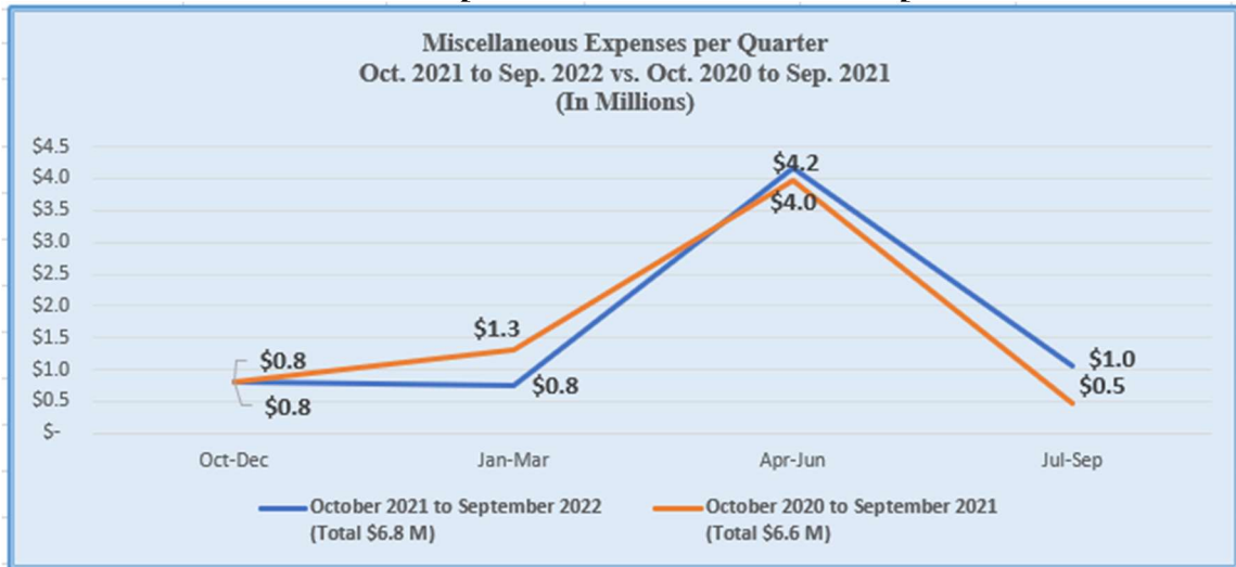
Figure 1: Miscellaneous Expenses per Quarter Oct. 2021 to Sep. 2022 versus Oct. 2020 to Sep. 2021

Figure 2 below shows the quarterly spending trend for miscellaneous expenses for the last two years: