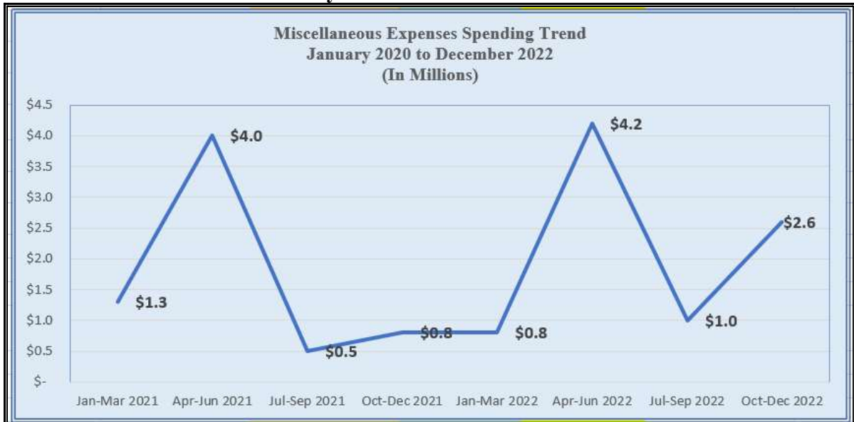
Figure 2: Miscellaneous Expenses Spending Trend January 2020 to December 2022

As shown in the above chart, miscellaneous expenses were highest during the last quarter of the fiscal year. This was due to accrual of expenses, mainly advertising, in June of each fiscal year.