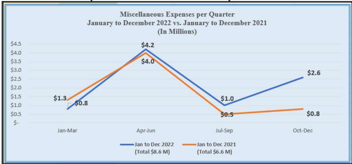
Figure 1: Miscellaneous Expenses per Quarter January to December 2022 versus January to December 2021

Figure 2 shows the spending trend for miscellaneous expenses for the last two years: