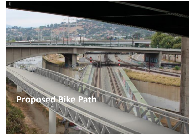
Proposed Bike Path