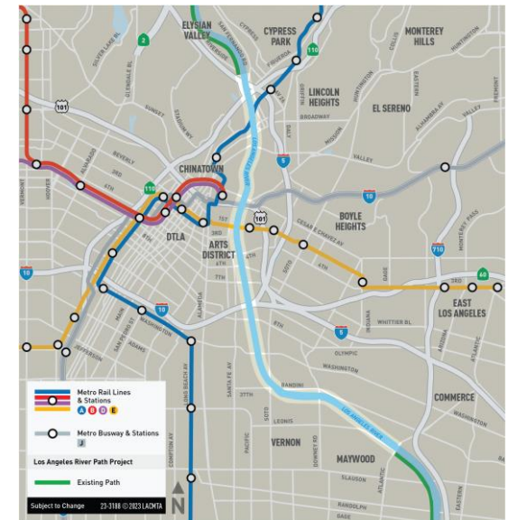
Project Area Map