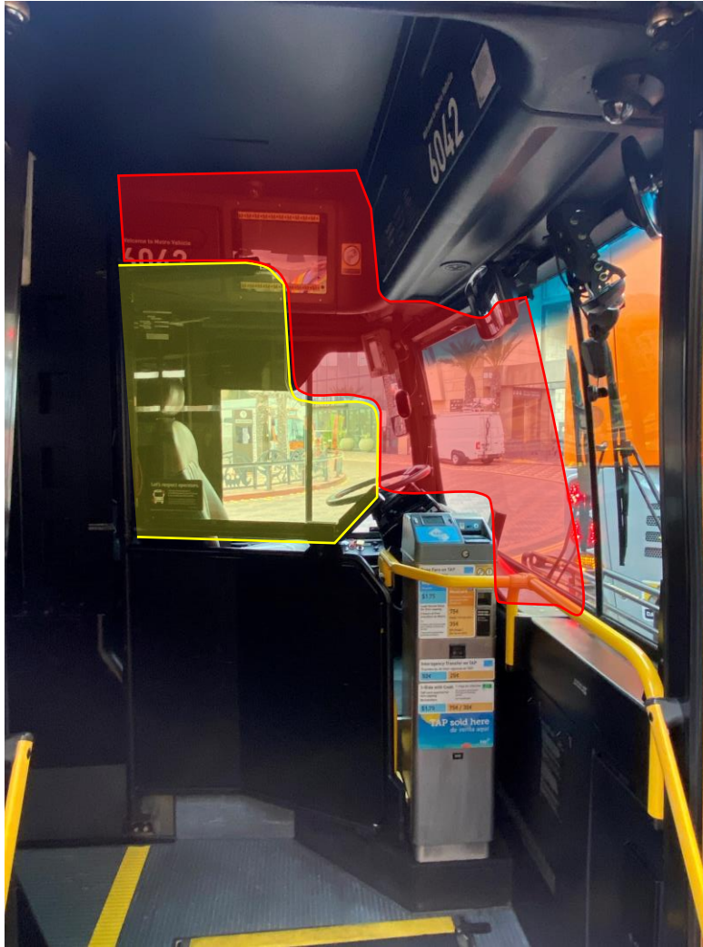
Current Barrier Design