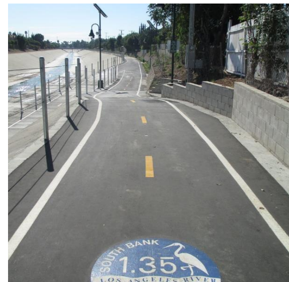
Segment of LA River Bike Path completed in 2014