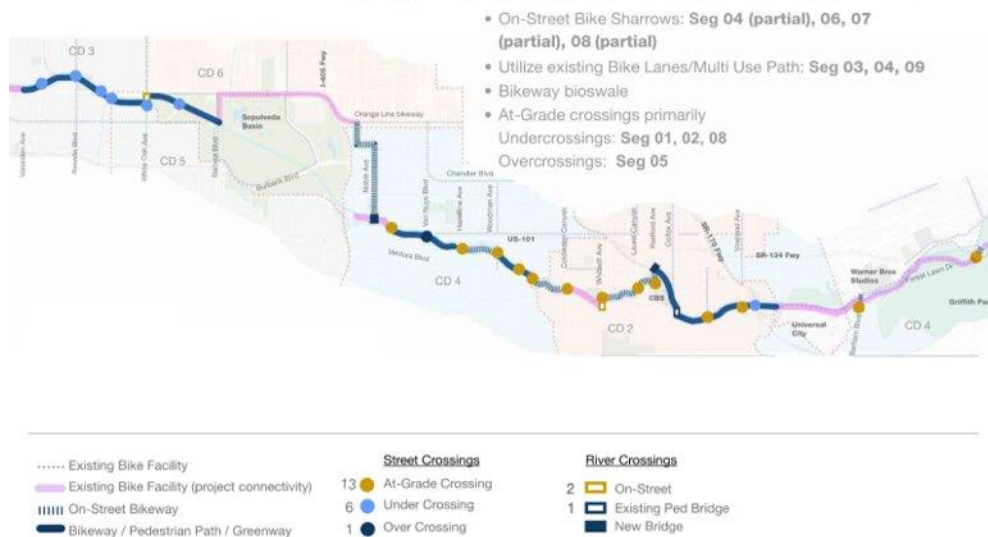
Project Corridor Map