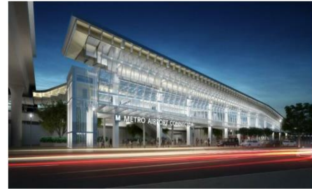
Airport Metro Connector