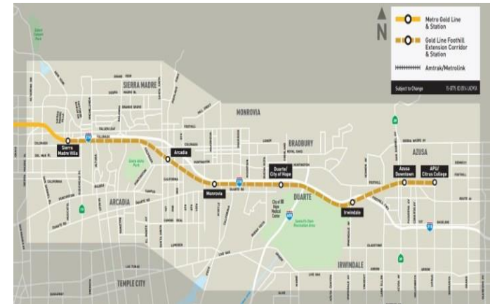
Gold Line Foothill