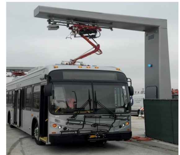
J-Line Zero Emission infrastructure