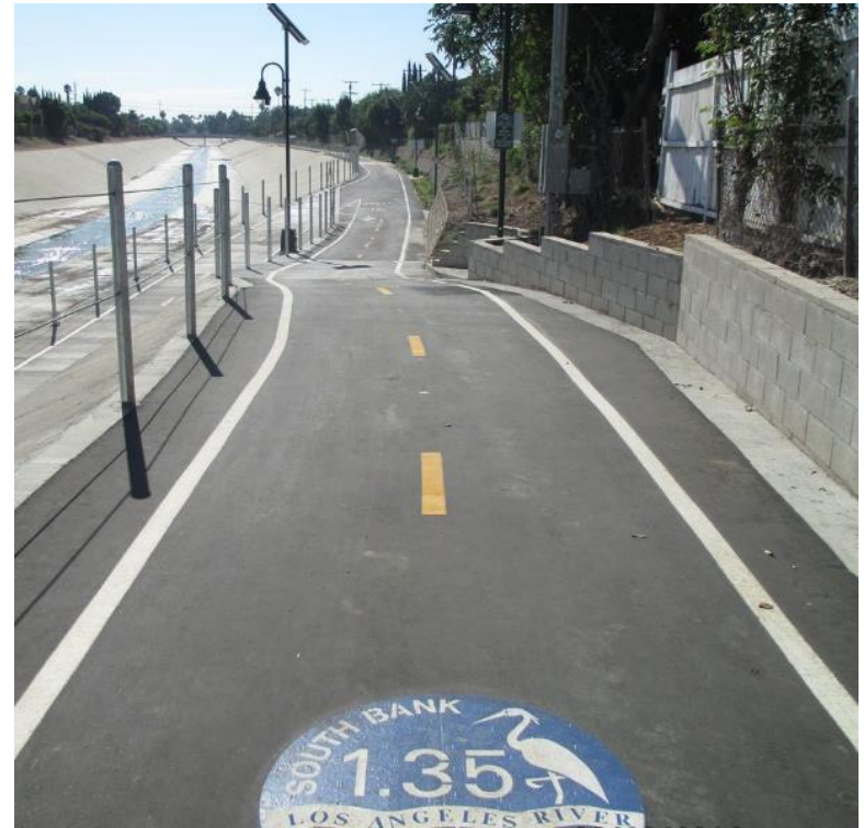
Segment of LA River Bike Path completed in 2014