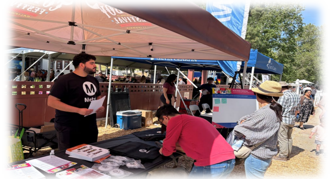
Santa Clarita Cowboy Festival