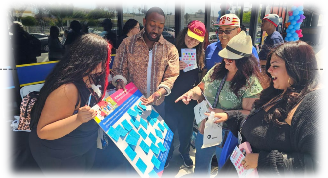
Metro LIFE South LA Open House