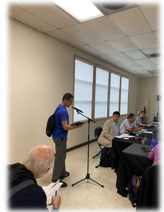
Gateway Cities Metro Service Council Meeting