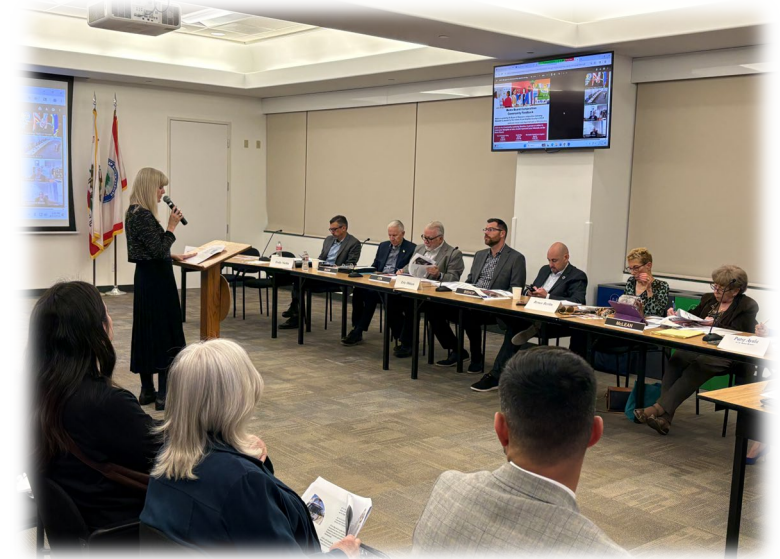
Presentation to North Los Angeles County Transportation Coalition (NCTC)