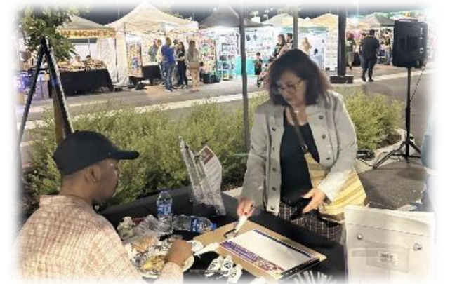
Metro Pomona North Night Market