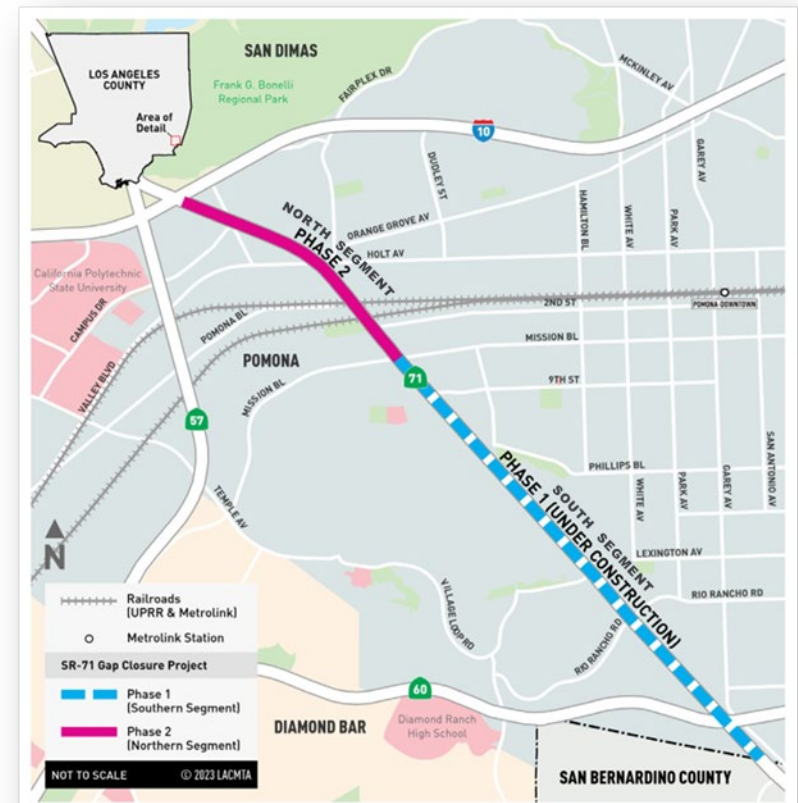
SR-71 North Project Limits I-10 to Mission Boulevard