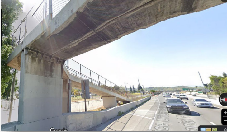
BEFORE Grier Street Pedestrian Overcrossing