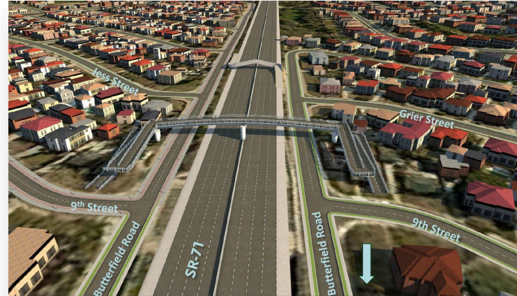
AFTER NEW 9TH STREET POC RENDERING (replaces the Grier Street POC)