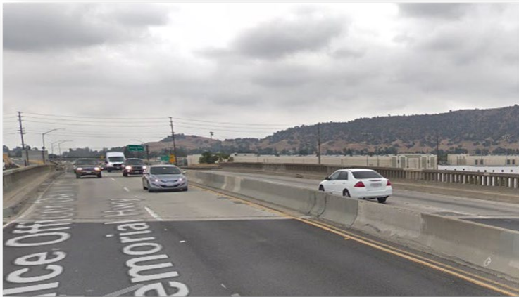
BEFORE Rail Bridge Construction