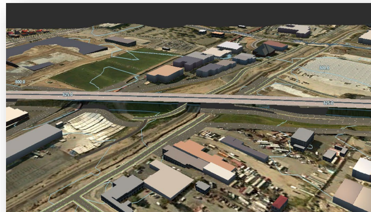
AFTER Rail Bridge Reconstruction Rendering