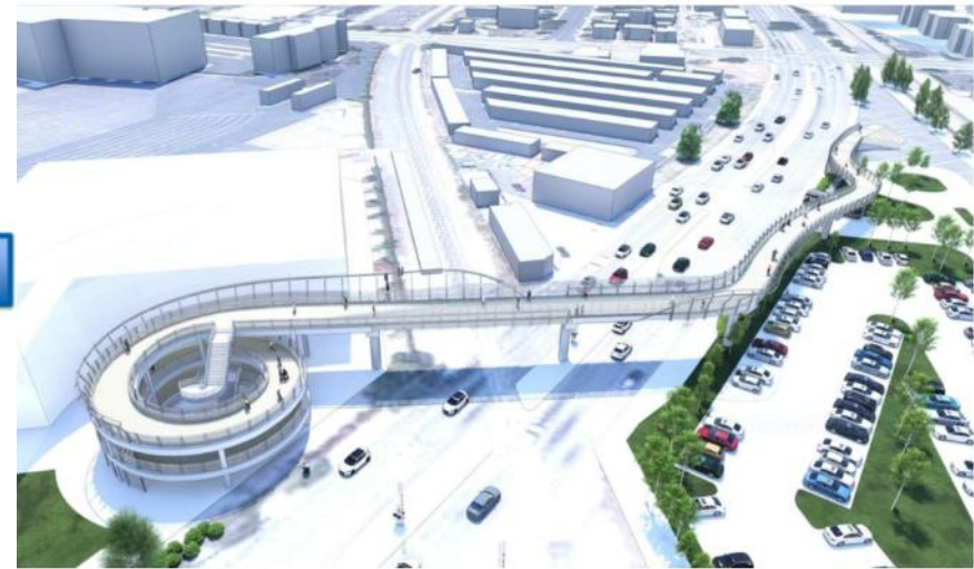
An aerial rendering of the La Verne Regional Multimodal Bridge. Note the large, clear cube in various renderings represents future transit oriented development.